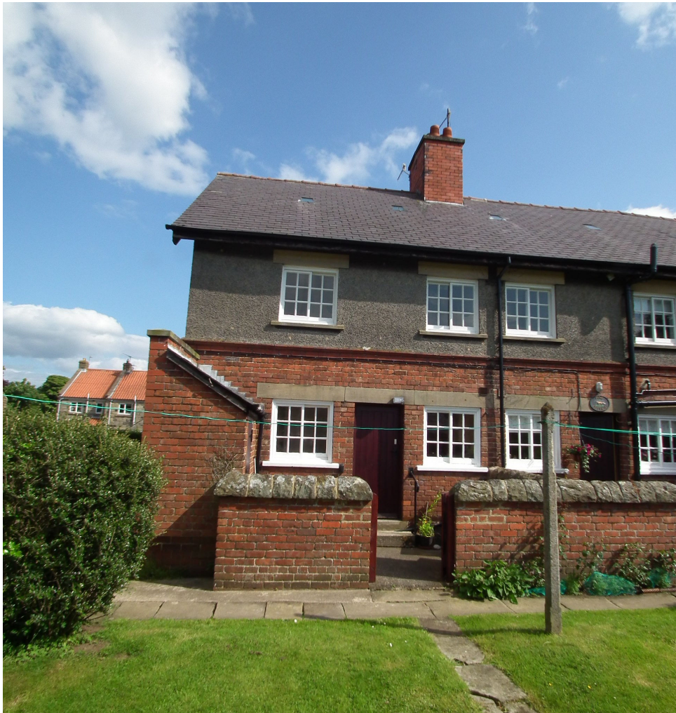
Hawthorn Cottage, Lealholm £475 pcm